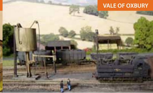
VALE OF OXBURY