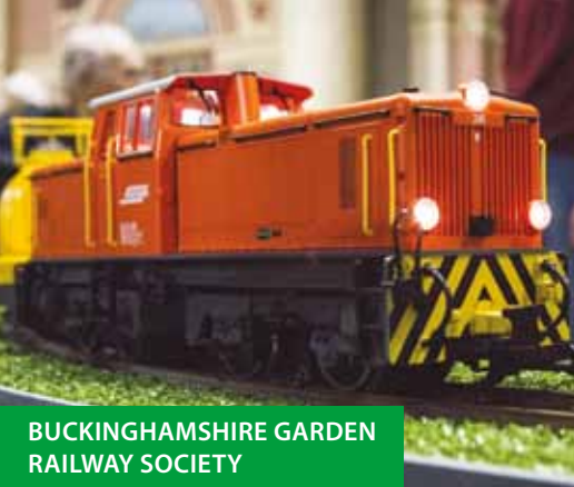
BUCKINGHAMSHIRE GARDEN RAILWAY SOCIETY