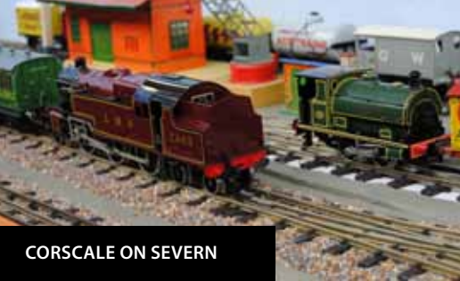
CORSCALE ON SEVERN