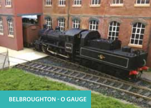
BELBROUGHTON - O GAUGE