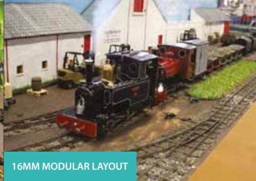
16MM MODULAR LAYOUT