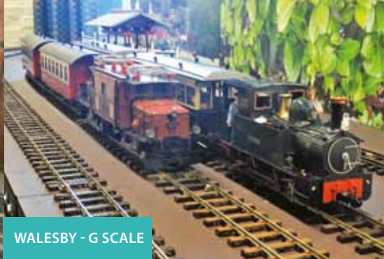
WALESBY - G SCALE